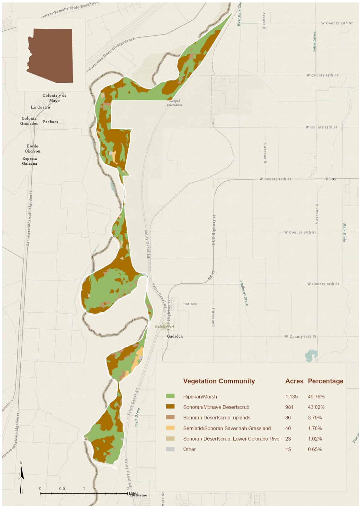
Lower Colorado River Gadsden Riparian Area Important Bird Area